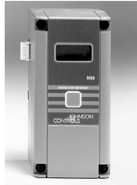
Figure 1: System 350 Display Module

As are all System 350 products, the display modules are housed in a NEMA 1 high-impact thermoplastic enclosure. The modular design provides easy, plug-together connections for quick installation and future expandability.