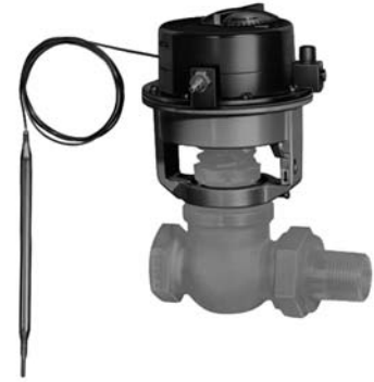
T-3311 Integral Thermostat and Piston Top Valve Actuator