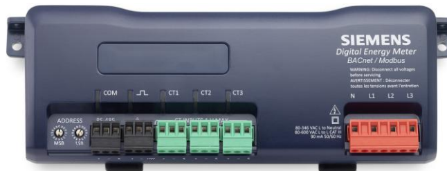
MD-BMS Power Metering Kit

The display model (MD-BMED), features an integrated 2 x 16-character backlit display which cycles through key configuration data along with voltage, current, power, and power factor, by phases.