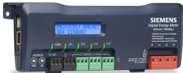
MD-BMED Power Metering Kit with Ethernet and 2 x 16-Character Backlit Display