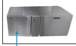
Blank Top Door