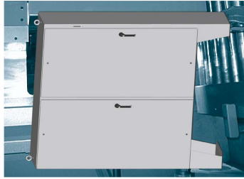
Available within 10 working days / not in stock

IS5 - Industry Standards - NEMA Type 4, 4X, 12 & Type 13 UL Listed Type 4, 4X & 12 CSA Type 4, 4X & 12 IEC 60529 IP66