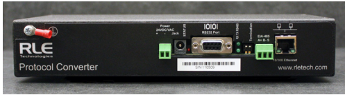
Protocol Converter - Single EIA-485 port