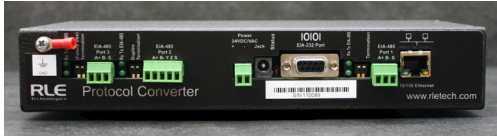
Dual Port Protocol Converter - Three EIA-485 ports

Thank you for purchasing a Protocol Converter. Before you begin to install and configure your device, consult rletech.com to ensure you're working with the most recent version of documentation for that product. The Protocol Converter User Guide is also available at rletech.com. If you need additional assistance, email our support staff - support@rletech.com, or call us at 800.518.1519.