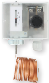
Manual reset option shown